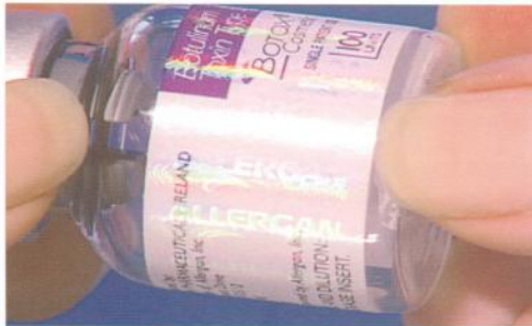
The above image depicts a US FDA-approved BOTOX® Cosmetic vial.

Only licensed and trained healthcare professionals have the experience necessary to administer BOTOX® Cosmetic. Allergan, Inc., the maker of BOTOX® Cosmetic, is the only source for healthcare professionals to purchase the product, and each US FDA label has the "Allergan" hologram.