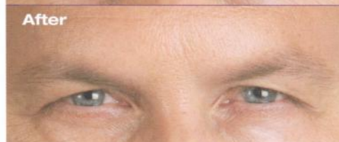
Unretouched clinical photos taken while frowning before and 14 days after treatment with BOTOX® Cosmetic.

Your own results may vary—be sure to talk to your doctor about what you can expect.